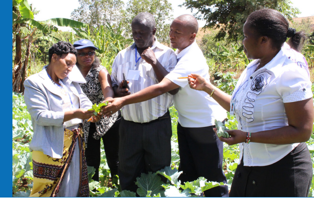
Building the capacity of Agriculture Extension Officers through field training

Climate change causes negative global impacts on food security and ecosystem services evident in sub-Saharan Africa. Adaptation to climate change requires adjustment of processes, practices and structures to control potential negative outcomes while benefiting from opportunities associated with the changing climate.