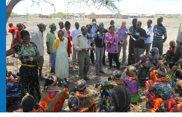
ILRI engaging various stakeholders in Marsabit County on Index based Livestock Insurance

Livestock systems are a major component of the drylands of Africa and play a key role in the livelihood of local populations. In East Africa and the Sahel, pastoralism is the principal livelihood for over 40 million people and represents up to 60 percent of agricultural Gross Domestic Product (GDP).