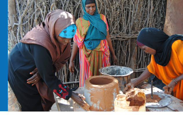
Jiko Women Group members constructing a jiko in Habaswein

Households in Wajir still cook using the traditional three-stone open fire hearths, which require huge loads of firewood. Apart from deliberate destruction of the forest cover, these energy sources also contribute significant pollutants including carbon dioxide that are harmful to the environment.