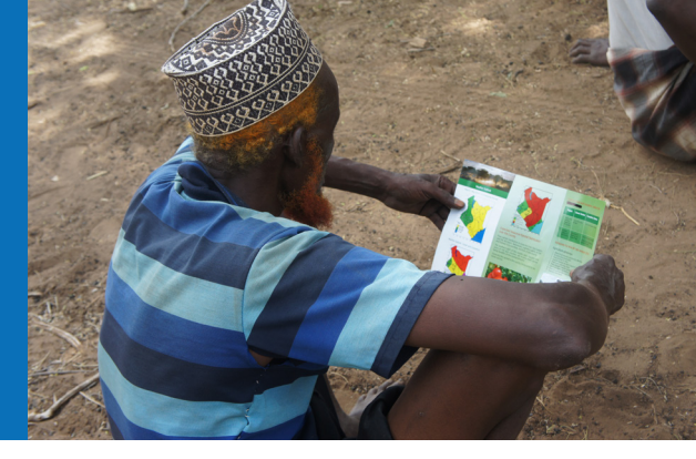
A community member catching up on climate advisories in Garissa, Kenya

Climate information is gaining ground as a resource to support adaptation decision-making, helping farmers, pastoralists, local government organisations, sectors services, and non-state actors to anticipate and plan for the coming seasons.