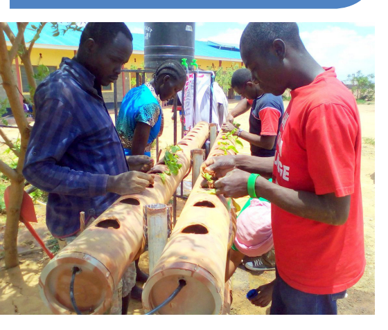
Ukulima Tec members setting up a vertical irrigation system

Joto Afrika is a series of printed briefings and online resources about low emission and climate change adaptation actions. The series helps people understand the issues, constrains and opportunities that they face in adapting to climate change and improving livelihoods. Joto Afrika is Swahili; it can be loosely translated to mean 'Africa is feeling the heat'.