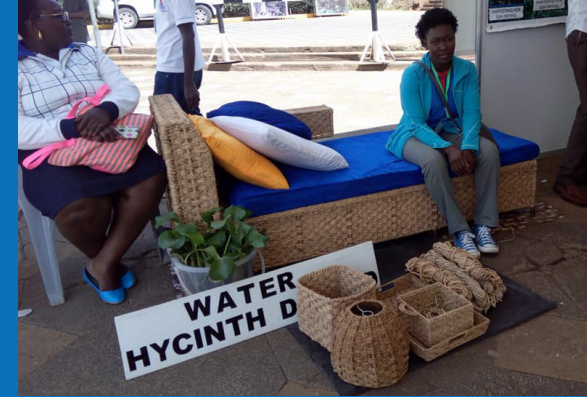
Kisumu National Polytechnic students displaying products made from water hyacinth during the 6th National Science Week

Science, innovation and technology is a vital source of potential solutions to climate change. The availability of new technologies is key to an effective global and national response to climate change. They could help mitigate, or reduce greenhouse gas (GHG) emissions and enable communities to adapt to climate change.