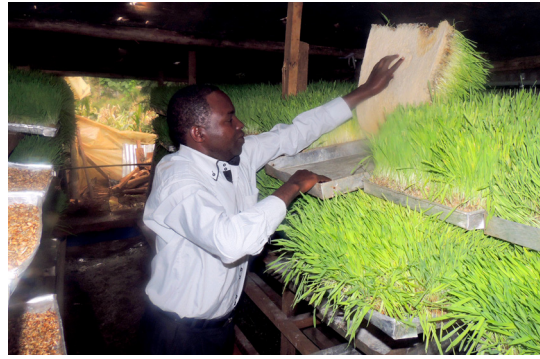
Hydroponics: Inspecting the progress of the barley fodder before harvesting

Scaling Support for Green Innovations by Kenya Climate Innovation Centre in Joto Afrika April Issue 2016 http://alin.or.ke/Joto%20Afrika