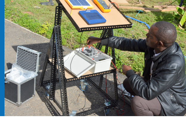
Strathmore Energy Resource Centre staff setting up a solar PV system

The Strathmore Energy Research Centre (SERC) response to climate achieving change focuses on Sustainable Development Goals response (SDGs). The includes: research and consultancy for the renewable energy sector; training of solar photovoltaic (PV) technicians; and testing of solar PV products.