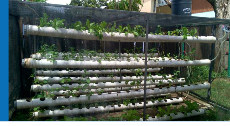
A vertical irrigation system set on a raised garden

The impact of climate change on food security and environmental stability adversely affects the human population, especially in Sub-Saharan Africa. In this respect, vertical farming forms an innovative mitigation mechanism of reducing food shortages in Kenya and across national boundaries while adapting to climate change.