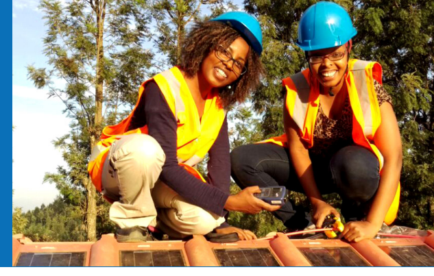
A team installs solar powered roofing tiles on a residential house

The Kenya Climate Innovation Center (KCIC) has been in the forefront in supporting innovations that seek to mitigate against and adapt to climate change effects. Working in three main sectors: renewable energy, water and agriculture, the organization has overseen the growth of businesses, some from the prototype stage to fullyfledged businesses. The organization provides business advisory services, access to finance, information and facilities providing an enabling environment for business.